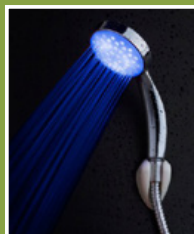
LED shower head